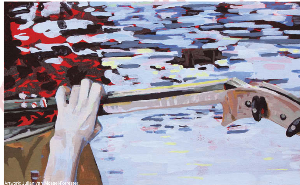
Artwork: Julian van Mossel-Forrester

Tickets $15 general $10 seniors/arts workers $5 students